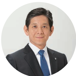
Yamaha Music Foundation President

Music is a wonderful form of art created and nourished by humanity. Music culture has provided countless emotions for people's hearts. Yamaha Music Foundation conveys the joy of music to as many people as possible beyond the boundaries and languages, and helps cultivate a rich sensitivity so that emotions can be freely expressed through music. In so doing, we hope to contribute to creating a healthy society.